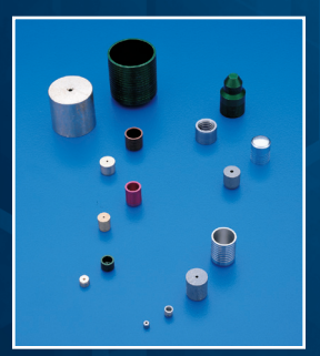
Lee Plug<sup>®</sup> Expansion Plugs

The Lee Company is wholly dedicated to high-precision fluid control. We offer a wide range of solutions, all engineered to deliver the highest levels of reliability and performance.