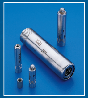
Flow Control Components