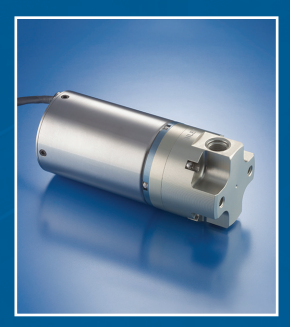
Positive Displacement Pumps