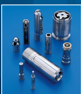
Lee Chek® Valves